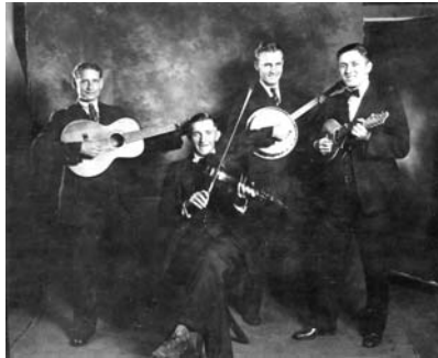
The Roane County Ramblers 1928